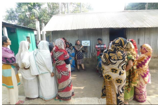
Courtyard meeting on WASH

To enhanced capacity of community, local elites, CSOs and community clinic, Hospital, institution, LGSs have created opportunity for hard-to-reach poor communities in availing WASH facilities and services WASH facilities and services at Biswambharpur and Tahirpur Upazila under Sunamganj distrit which is supported by Wateraid Bangladesh. Tahirpur is one of the low-lying haor area, disaster and poverty prone area in Bangladesh. Natural disaster like flash flood, heavy rain, sometimes earthquake is a common phenomenon in Tahirpur and Biswambharpur. Soil erosion in river is one of the major disasters, so, natural water flow is disrupted due to siltation the river and canal, also, flash flood damages the crop just before the harvesting period.