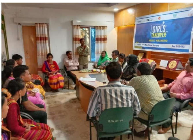
Girls Takeover event

The project is centered on the idea that children and youth should be at the forefront of their own development, with their needs, interests, and perspectives guiding the design and implementation of programs and services. By empowering children and youth to take an active role in their own development, the project aims to promote their sense of agency, self-esteem, and resilience.