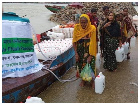
Safe water distributed during disaster

Sunamganj district is prone to natural disaster such as flood, cyclones, and landslides due to its location in the haor basin. These disasters can cause significant damage to infrastructure, disrupt the supply of essential items, and lead to the displacement of local populations. Emergency contingency stock can provide a critical lifeline during such disasters, ensuring that people have access to food, water, and medical supplies until assistance can be provided. It can also help reduce the burden on relief efforts and ensure that aid is delivered to those in need in a timely and efficient manner.