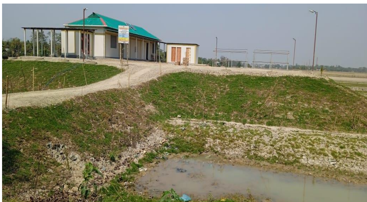
ERA established a Flood Shelter for Flood Affected People which is funded by Norwegian Refugee Council