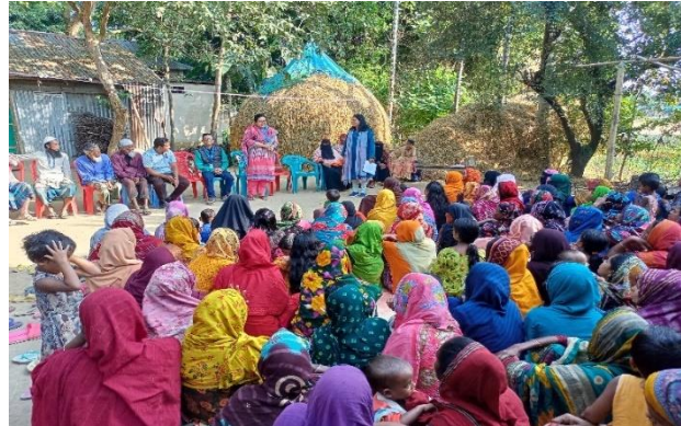
Consultation Meeting with Community

The strategies of the proposed project are structured with a view to effective attainment of set outcomes. Approaching a comprehensive working modalities keeping focus on climate risk/vulnerabilities and alignment with interest of most marginalized where women, girls, boys, PwD and transgender will be given highest priority.