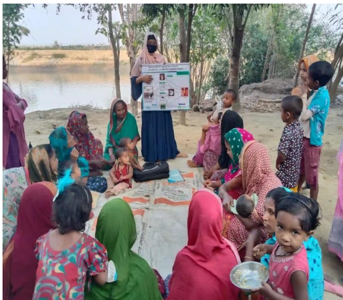
Hygiene Session conducted by CV

Resilient WASH is designed to address these challenges by building water and sanitation systems that are resilient to flooding and other natural disasters. This involves using appropriate technologies and management strategies that can withstand the impacts of floods and ensure that communities have access to safe water and sanitation facilities even during emergencies.