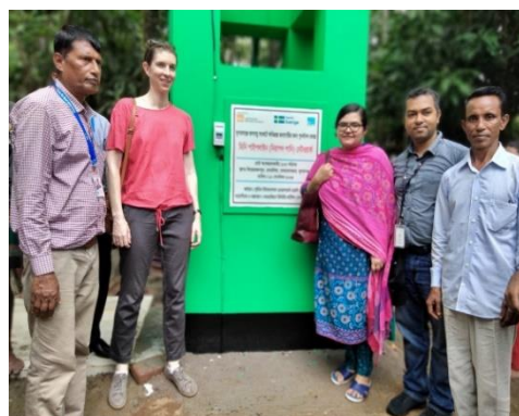
Water networking System Installation

ERA and NRC have implemented the Restoration of Essential Service towards Unmet Measures of Emergency (RESUME) to the flood affected Communities in Sunamganj District of Bangladesh project at Dowarabazar and Chhatak Upazila. This project has developed in response to the devastating impact of floods on the lives and livelihoods of people in the community, will provide much needed support to help them recover. The project will focus on providing training, resources and support to individuals and families to help them re-establish their income streams. Our goal is to help these flood affected communities rebuild their livelihoods, become more resilient to future shocks, and regain their economic independency and stability.