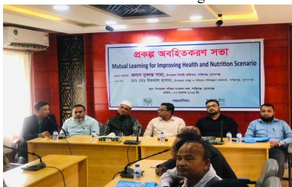
Project Inception Meeting with Stakeholders

Bangladesh and Nepal have experienced identical health care and nutritional challenges for the most vulnerable people specially women and children. Mutual learning for Improving Health and Nutrition Scenario project aims to address health related challenges by exchanging learning experience, approach, tools, development thoughts etc. between two organizations ERA in Bangladesh and RICOD in Nepal who have been representing two countries. The project intends to contribute to the improvement of nutritional and health care status of women and children of the targeted communities with quality health care service through the organizations.