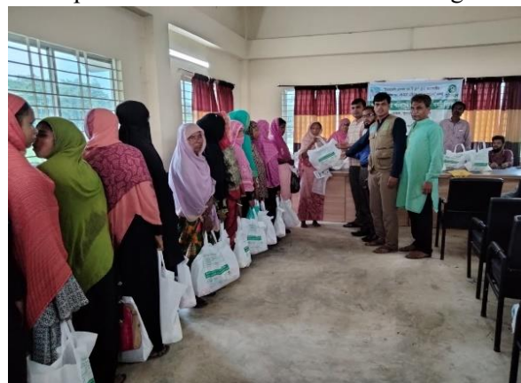
Hygiene Kits Distribution

The emergency response for the Flash Flood Affected Population of North East Area of Bangladesh project is a humanitarian project aimed at providing relief and assistance to the people affected by flash floods in the northeast areas of Bangladesh. The project was implemented in Chhatak Upazila under Sunamganj district. The project is designed to help the affected population cope with the immediate aftermath of the disaster and to provide them with the resources they need to rebuild their lives. The project provided emergency relief, such as water, cash, and hygiene kits, to the affected population. It also provided psychosocial support to help people deal with the trauma and stress of the disaster.