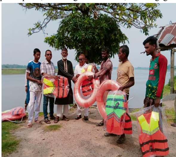
Figure 5: Boat distributed for Anticipatory Action

Adhering to the agreed plan, the ERA team accomplished all targeted interventions within the reporting period. Following standard procedures, nine CfW schemes were completed in coordination with respective Union Parishads (UP) and the Project Implementation Committee (PIC). A total of 400 CfW participants, including 22% females, were engaged successfully. One hundred fifty participants received