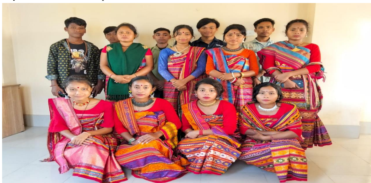
Figure 3: Ethnic Adolescent Group

The child & Youth Centered Development Project works in partnership with local communities, organizations, and governments to ensure that children and youth have access to the resources and support they need to reach their full potential.