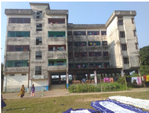
Figure 12: Child Girls' Home (Before)

Renovation of Sunamganj Girls Home and Flood Affected Schools Project was executed through a meticulous and inclusive strategy. Initially, a comprehensive assessment was conducted to identify the specific needs of both child home and school. This involved collaborative discussions with caregivers, educators, school management committee, Upazila education department, and District social welfare service department to gain insights into the unique requirements of each space. Subsequently, a detailed project plan was developed, outlining the scope of work, budgetary considerations, and a timeline for implementation. Renovation activities were carried out in a phased manner, prioritizing critical areas such as living residences in child homes and classrooms in schools. Skilled professionals and local contractors were engaged to ensure the quality and safety of the renovations. The school management community and respective departments played a pivotal role in the process, with active participation in decision-making and project monitoring. Regular communication channels were established to keep all stakeholders informed about the progress and address any concerns promptly. The successful completion of the program not only transformed physical spaces but also contributed to creating more nurturing and conducive environments for both children and students, fostering overall well-being and development.