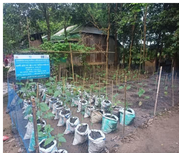
Figure 10: Sack Gardening

The climate related economic insecurity caused less priority to the girls education and potentially provoked the early marriage arrangement. The issue of dignity of women, girls adolescent are neglected which is often imposed unhealthy practices to the child marriage. The absence of sustainable income and employment opportunity is having a negative impact on climate risk and vulnerabilities. Climate focused capacity building at the community are still inadequate which hinders the climate resilient livelihood practices. Given the situation, climate risk education and climate friendly livelihoods development are of paramount importance which will accelerate the pace of sustainable development by creating a capable climate resilient community.