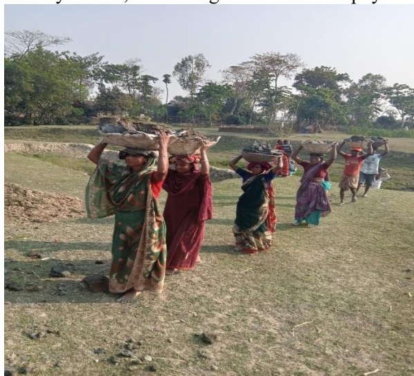
Figure 4: Cash for Work (CfW)

ERA has initiated a flood recovery initiative entitled "Restoration of Essential Services for Climatic Displacement affected communities of Bangladesh," in collaboration with the Norwegian Refugee Council (NRC) since October 1, 2023 to February 28, 2024. This project is made possible through funding from the Swedish International Development Agency (SIDA) and is being implemented in Chhatak and Dowarabazar Upazial under the Sunamganj district. The primary goal of this project is to provide rehabilitation support to communities affected by floods, enhancing their access to physical infrastructure, Water, Sanitation, and Hygiene (WaSH), income generation, and building resilience against future climate risks. Operational planning, and preparing implementation guidelines, as well as activities like Cash for Work (CfW), sanitary latrine installation, Killa construction, Project exit meeting at UP level, and School WASH, were all essential for a successful commencement of field-level operations. Conducting vulnerability assessments, identifying stakeholders, and garnering stakeholder support were also key focuses during this period. Through collaborative efforts with NRC, ERA effectively achieved these milestones, ensuring a strong start to implementation in an integrated manner.