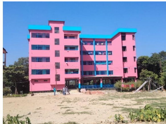
Figure 11: Child Girls' Home (After)

The Child Home Renovation program was delivered in Sunamganj Sadar Upazila, while the School Renovation activities took place in Dowarabazar Upazila, both located within the Sunamganj district. These specific geographic locations were chosen based on a thorough needs assessment that identified these areas as having a pressing need for infrastructure improvement. Sunamganj Sadar Upazila, with its child home, became the focal point for targeted renovations to enhance the living conditions of the children in these facilities. Simultaneously, Dowarabazar Upazila, within Sunamganj district, was selected for school renovations, with a focus on upgrading classrooms and essential facilities. The choice of these locations aimed to address the unique needs of both child home and school in distinct communities within Sunamganj district, contributing to the holistic development and well-being of children in the region.