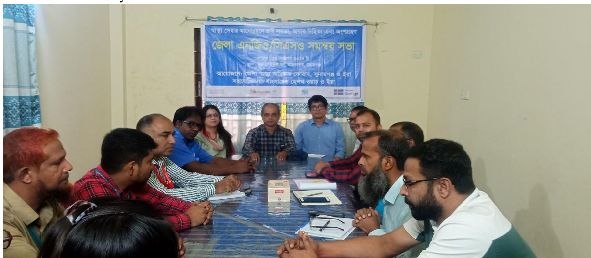
Figure 7: CSO Coordination Meeting

The Health Rights Forum Sunamganj is a non-government platform in Bangladesh that aims to promote health and human rights for marginalized communities in the Sunamganj district. The platform focuses on improving access to healthcare services and advocating for the rights of vulnerable populations, including women, children, and people living in poverty. The forum works to raise awareness about health and human rights issues through community education and advocacy campaigns. They also provide medical care and support to those in need, including emergency services during natural disasters such as floods and cyclones.