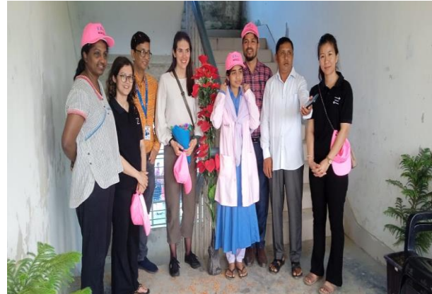
Figure 1: Mid Term Review Team and Participants

The project seeks to contribute to the improvement of nutritional and healthcare conditions for women and children in targeted communities by promoting quality healthcare services through the efforts of both organizations. Initially, the project was designed to involve the exchange of participants between the two countries to share best practices. This was achieved through hands-on training, demonstrations, and planning sessions focused on primary healthcare.