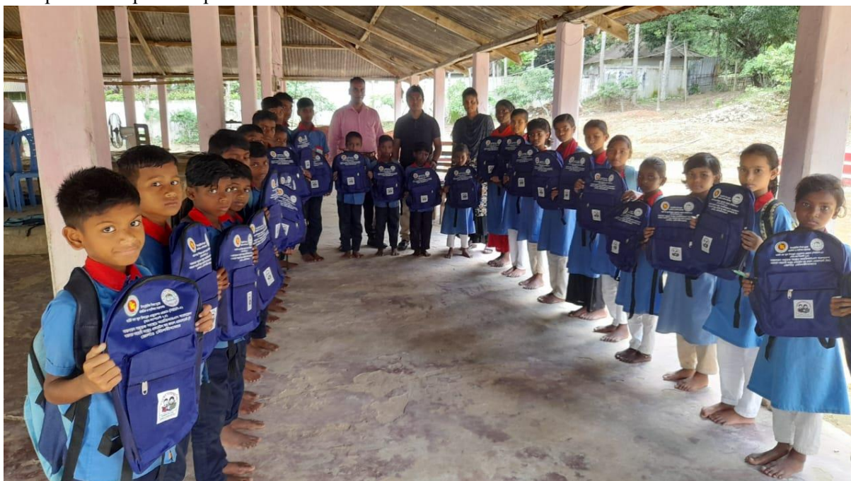
Figure 8: School bag distribution ceremony

The Out of School Children Program is an initiative in Bangladesh that provides education and training opportunities who were unable to complete their formal education. The program aims to provide these individuals with the skills and knowledge they need to improve their job prospects, income, and quality of life. The Out of School Children Program is implemented by the Bangladesh government in collaboration with various non-governmental organizations and educational institutions. It offers a range of course and training programs, including basic literacy and numeracy, vocational training, and entrepreneurship development.