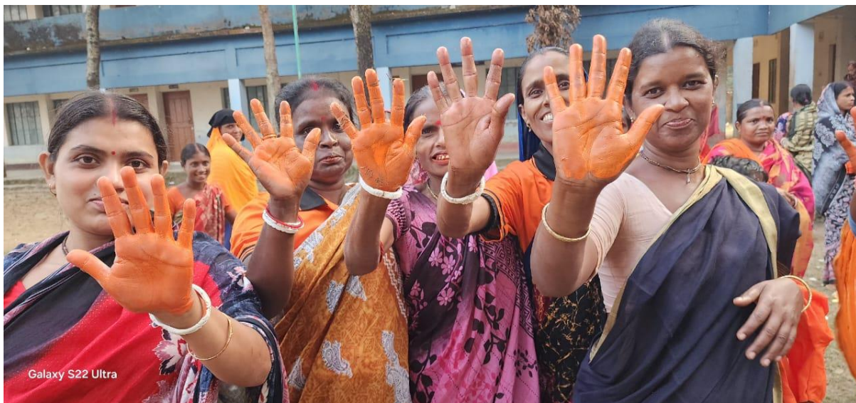
Figure 9: 16 Day Activism observation

The proposed project is fully aligned with its Goal: “Build women’s leadership capacity and increased resilience of the most vulnerable communities to address climate change impact” with specific focus on climate driven impact that leverage community resilience against climate-related risk and boost up the collective social actions for preparing them to combat against climate change impacts. Actions are focused on empowering women and adolescent girls to establish access in local government structure that facilitate climate-driven actions in local development planning allowing interest of the most marginalized. The strategies will keep a transparent and accountable governance to promoting pro-poor oriented service delivery among the local government and service provider institutions, in order to mitigate the adverse climate effects protecting interest of most marginalized women, girls, boys, PwD and transgender within the targeted communities.