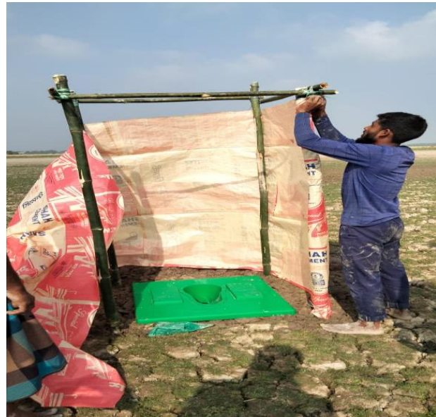
Figure 6: Latrine installed in Emergency

Sunamganj district is prone to natural disaster such as flood, cyclones, and landslides due to its location in the haor basin. These disasters can cause significant damage to infrastructure, disrupt the supply of essential items, and lead to the displacement of local populations. Emergency contingency stock can provide a critical lifeline during such disasters, ensuring that people have access to food, water, and medical supplies until assistance can be provided. It can also help reduce the burden on relief efforts and ensure that aid is delivered to those in need in a timely and efficient manner.